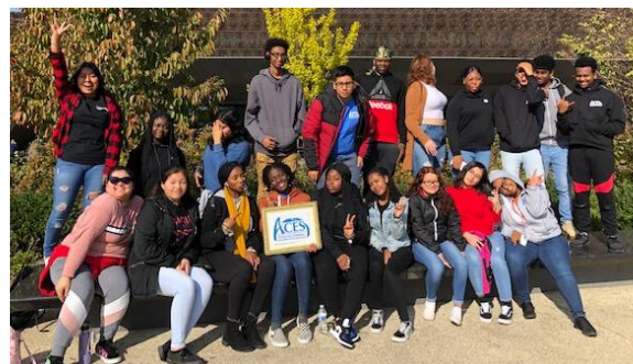
ACES students from Montgomery Blair High School at the NMAAHC