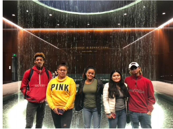
Montgomery College Rockville Campus Students at the NMAAHC

Our ACES staff, faculty, and students visited the NMAAHC, the only national museum devoted exclusively to the documentation of African American life, history, and culture. From the majestic architecture of the magnificent building structure, you enter a historical timeline that deepens your understanding of the plight AND the triumph of the African American challenging journey here in America. The museum's mission is deeply woven throughout one's visit - which is to "stimulate open dialogue about race, and promote reconciliation and healing". As Lonnie G. Bunch III, Founding Director (and presently the first African American Director of the Smithsonian Institution) "This building will sing for all of us".