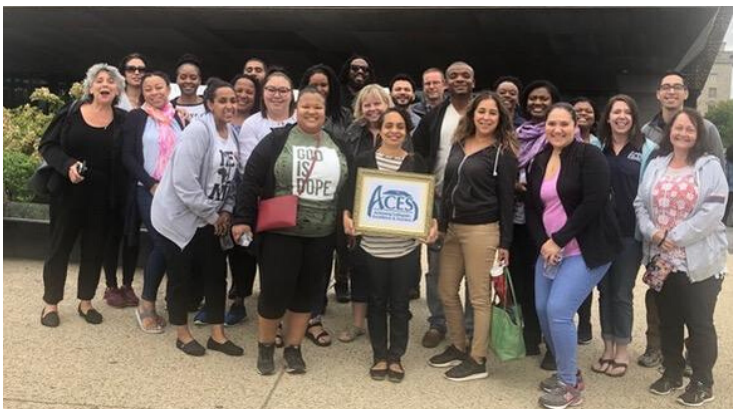
ACES Staff, September 2019