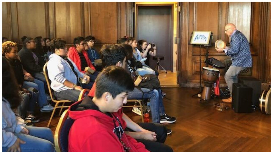
Empowering our Future Artists with Skills ACES Students Attending the 3rd Annual Careers in the Arts Workshop