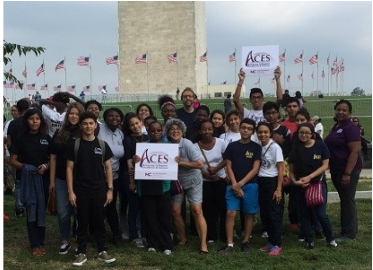
ACES students and staff at the Washington Monument