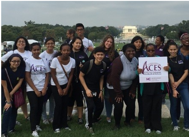
ACES students in front of the Lincoln Memorial