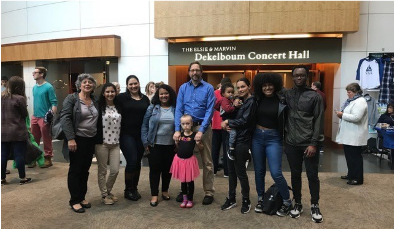
Pictured above: ACES students, their families, and staff in front of the concert hall at University of Maryland prior to the performance.

We give special thanks to Young Artists of America at Strathmore (YAA) for donating 25 tickets to our ACES “Arts and Culture” program for students, coaches and their families from Paint Branch High School, Northwood High School, and Einstein High School to attend their spectacular production of “The Sound of Music” at the Clarice Center, at University of Maryland, Sunday, October 29, 2017.